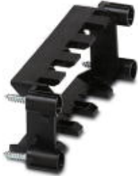
Sleeve frame, without PE, for contact insert modules, type 3, number of insert modules 4

Please be informed that the data shown in this PDF Document is generated from our Online Catalog. Please find the complete data in the user's documentation. Our General Terms of Use for Downloads are valid ( http://phoenixcontact.com/download )