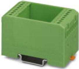
Electronic housing, for PCB insertion, without screw connection terminal blocks and cover

Please be informed that the data shown in this PDF Document is generated from our Online Catalog. Please find the complete data in the user's documentation. Our General Terms of Use for Downloads are valid ( http://phoenixcontact.com/download )