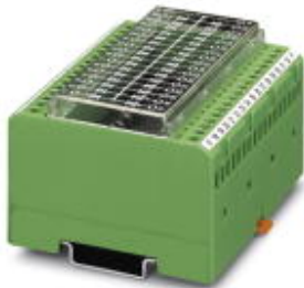
Diode module, with 32 diodes, common anode, diode type 1N 4007

Please be informed that the data shown in this PDF Document is generated from our Online Catalog. Please find the complete data in the user's documentation. Our General Terms of Use for Downloads are valid ( http://phoenixcontact.com/download )