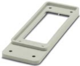
HEAVYCON adapter plate, type B24 on B16, for panel cutouts of type B24, gray

Please be informed that the data shown in this PDF Document is generated from our Online Catalog. Please find the complete data in the user's documentation. Our General Terms of Use for Downloads are valid ( http://phoenixcontact.com/download )