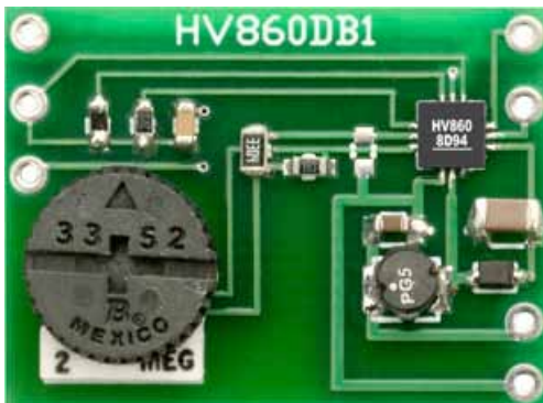
Actual Dimensions: 20mm x 25mm