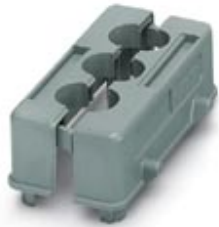
Divisible cable feed-through for HC-B16-AMQ (1771587) panel mounting base; for three conductors

Please be informed that the data shown in this PDF Document is generated from our Online Catalog. Please find the complete data in the user's documentation. Our General Terms of Use for Downloads are valid ( http://phoenixcontact.com/download )