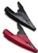
AC285-FL: Alligator Clips.