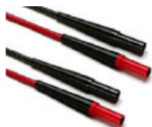
196-3523-00: Extender Leads (1.5 m).