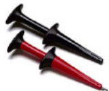
AC280-FL: Hook Clips.