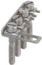
Switching jumper, Number of positions: 4, Color: silver

Please be informed that the data shown in this PDF Document is generated from our Online Catalog. Please find the complete data in the user's documentation. Our General Terms of Use for Downloads are valid ( http://phoenixcontact.com/download )