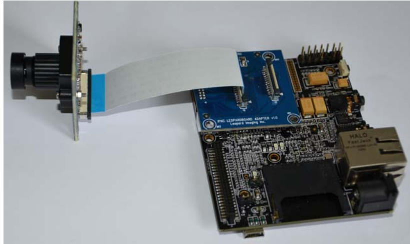
LI-CAM-OV2715 WITH Leopardboard 36x