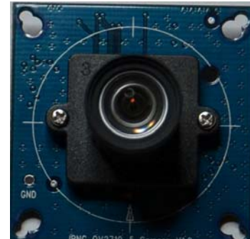
LI-CAM-OV2715 Camera Module

Leopard Imaging provides the Time-to-Market camera development kit with seamless interface to TI IPCamera with a standard 36-pin ZIP connector interface as well as Leopardboard 365 or Leopardboard 368 through an adapter board LI-VCAMADAPTER. LI-CAM-OV2715 is a high-resolution digital camera Module. It incorporates an OmniVision 1/2.7-inch CMOS digital image sensor OV2715, with an active imaging pixel array of 1920H x 1080V. The LI-IPCAM-OV2715 Camera Module produces extraordinarily clear, sharp digital pictures, and it is capable of capturing both continuous video and single frame, which makes it the perfect choice for surveillance industry, machine vision industry.