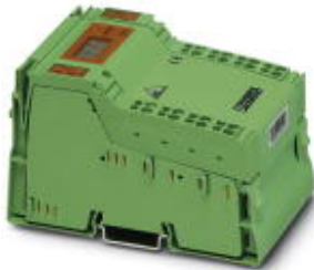
AS-i Gateway for Inline, IP20 protection, color: Green

Please be informed that the data shown in this PDF Document is generated from our Online Catalog. Please find the complete data in the user's documentation. Our General Terms of Use for Downloads are valid ( http://phoenixcontact.com/download )