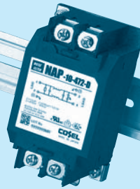
DIN rail installation type is option