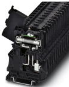
Lever-type fuse terminal block, black, for 6.3 x 32 mm G fuse inserts, with LED for 24 V DC

Please be informed that the data shown in this PDF Document is generated from our Online Catalog. Please find the complete data in the user's documentation. Our General Terms of Use for Downloads are valid ( http://phoenixcontact.com/download )