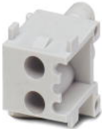
Contact insert module, for panel mounting frames for accommodating 2 optical fibers VC-FSMA-M ... Quick mounting connectors

Please be informed that the data shown in this PDF Document is generated from our Online Catalog. Please find the complete data in the user's documentation. Our General Terms of Use for Downloads are valid ( http://phoenixcontact.com/download )