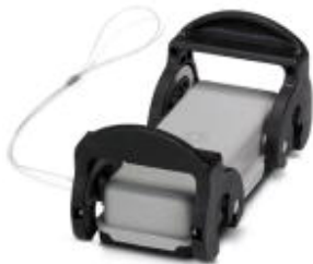
HEAVYCON protective cover, type B16, for sleeve housing without double locking latch, with retaining cord, IP54

Please be informed that the data shown in this PDF Document is generated from our Online Catalog. Please find the complete data in the user's documentation. Our General Terms of Use for Downloads are valid ( http://phoenixcontact.com/download )