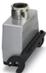
Coupling housing, with single locking latch, height 79 mm, with screw connection, 1x Pg29

Please be informed that the data shown in this PDF Document is generated from our Online Catalog. Please find the complete data in the user's documentation. Our General Terms of Use for Downloads are valid ( http://phoenixcontact.com/download )