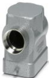
HEAVYCON sleeve housing B6, for single locking latch, height 72 mm, with support 1x M32, lateral conductor exit

Please be informed that the data shown in this PDF Document is generated from our Online Catalog. Please find the complete data in the user's documentation. Our General Terms of Use for Downloads are valid ( http://phoenixcontact.com/download )