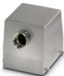
Sleeve housing, for double locking latch, height 80 mm, without screw connection, 1x Pg21, lateral cable entry

Please be informed that the data shown in this PDF Document is generated from our Online Catalog. Please find the complete data in the user's documentation. Our General Terms of Use for Downloads are valid ( http://phoenixcontact.com/download )