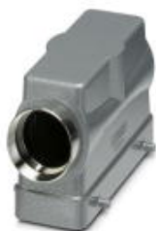
HEAVYCON sleeve housing B24, for double locking latch, height 76 mm, with support 1x M25, lateral conductor exit

Please be informed that the data shown in this PDF Document is generated from our Online Catalog. Please find the complete data in the user's documentation. Our General Terms of Use for Downloads are valid ( http://phoenixcontact.com/download )