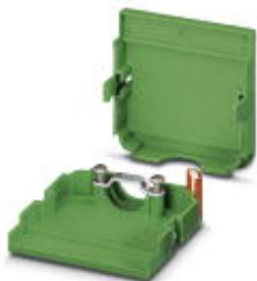
Cable housing, pitch: 3.81 mm, number of positions: 6, dimension a: 25.25 mm, color: green

Please be informed that the data shown in this PDF Document is generated from our Online Catalog. Please find the complete data in the user's documentation. Our General Terms of Use for Downloads are valid ( http://phoenixcontact.com/download )