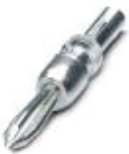
Test plugs, with solder connection up to 1 mm 2 conductor cross section, color: gray