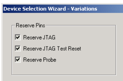
Figure 1-12 • Device Selection Wizard

The default for the software is Flexible mode; all boxes are unchecked. Table 1-5 lists the definitions of the options in the Device Selection Wizard.