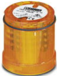
LED rotating light element, 24 V AC/DC, yellow

Please be informed that the data shown in this PDF Document is generated from our Online Catalog. Please find the complete data in the user's documentation. Our General Terms of Use for Downloads are valid ( http://phoenixcontact.com/download )