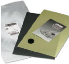
Polymer fiber polishing set, for F-SMA quick mounting connectors

Please be informed that the data shown in this PDF Document is generated from our Online Catalog. Please find the complete data in the user's documentation. Our General Terms of Use for Downloads are valid ( http://phoenixcontact.com/download )