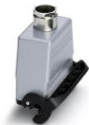
HEAVYCON coupling housing B16, with single locking latch, height 80 mm, with screw connection 1x Pg21

Please be informed that the data shown in this PDF Document is generated from our Online Catalog. Please find the complete data in the user's documentation. Our General Terms of Use for Downloads are valid ( http://phoenixcontact.com/download )