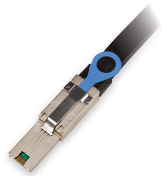
3M™ High Routability External MiniSAS Cable Assembly