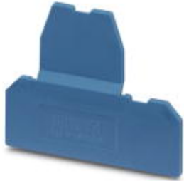
End cover, Length: 67 mm, Width: 2.5 mm, Height: 62 mm, Color: blue

Please be informed that the data shown in this PDF Document is generated from our Online Catalog. Please find the complete data in the user's documentation. Our General Terms of Use for Downloads are valid ( http://phoenixcontact.com/download )