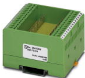
Custom circuit module, consisting of housing, MKDS 3 connection terminal blocks and PCB

Please be informed that the data shown in this PDF Document is generated from our Online Catalog. Please find the complete data in the user's documentation. Our General Terms of Use for Downloads are valid ( http://phoenixcontact.com/download )