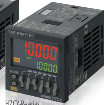
H7CX-R-series Digital Tachometer

Space-Saving 1/16 DIN Counters with All-in-One Functionality to Solve Most Counting and Positioning Applications