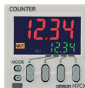
White (sold separately)

OMRON ELECTRONICS LLC • THE AMERICAS HEADQUARTERS • Schaumburg, IL USA • 847.843.7900 • 800.556.6766 • www.omron247.com