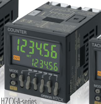
H7CX-A-series Multifunction Preset Counter with Six Digits