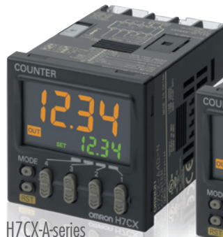
H7CX-A-series Multifunction Preset Counter with Four Digits