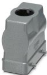
HEAVYCON B16 sleeve housing, for double locking latch, height: 76 mm, with 1 x M25 thread, straight cable outlet

Please be informed that the data shown in this PDF Document is generated from our Online Catalog. Please find the complete data in the user's documentation. Our General Terms of Use for Downloads are valid ( http://phoenixcontact.com/download )