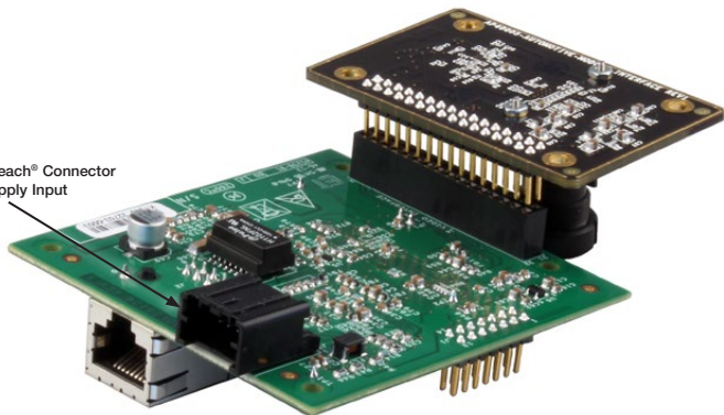
Figure 2: Qorivva MPC5604E Kit (bottom angle)

J3 - BroadR-Reach® Connector with Power Supply Input