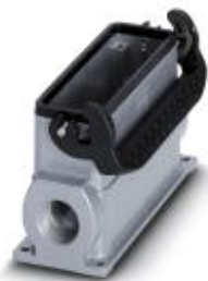
Box mounting base, with single locking latch, height 84 mm, without screw connection, 1x Pg29

Please be informed that the data shown in this PDF Document is generated from our Online Catalog. Please find the complete data in the user's documentation. Our General Terms of Use for Downloads are valid ( http://phoenixcontact.com/download )