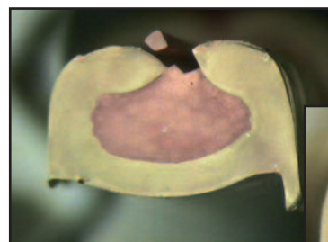
Visible Deformation of Outer Crimp Surface as a result of Indentation from Material Buildup on Crimper