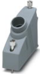
Plastic sleeve housing, locking screws with knurled head, type 4, cable screw connection Pg21

Please be informed that the data shown in this PDF Document is generated from our Online Catalog. Please find the complete data in the user's documentation. Our General Terms of Use for Downloads are valid ( http://phoenixcontact.com/download )