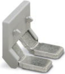
Insertion bridge, Pitch: 25 mm, Number of positions: 2, Color: gray

Please be informed that the data shown in this PDF Document is generated from our Online Catalog. Please find the complete data in the user's documentation. Our General Terms of Use for Downloads are valid ( http://phoenixcontact.com/download )