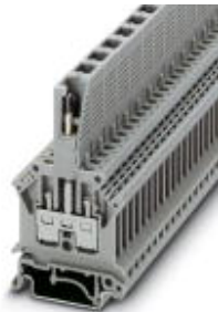
Component connector, Number of positions: 1, Color: gray

Please be informed that the data shown in this PDF Document is generated from our Online Catalog. Please find the complete data in the user's documentation. Our General Terms of Use for Downloads are valid ( http://phoenixcontact.com/download )