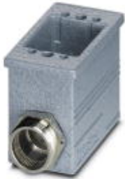
Box mounting base, made of metal, powder-coated type 1, number of modules 2, cable screw connection Pg16

Please be informed that the data shown in this PDF Document is generated from our Online Catalog. Please find the complete data in the user's documentation. Our General Terms of Use for Downloads are valid ( http://phoenixcontact.com/download )