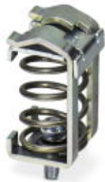
Shield connection terminal block, for applying the shield directly to the conductive mounting plates

Please be informed that the data shown in this PDF Document is generated from our Online Catalog. Please find the complete data in the user's documentation. Our General Terms of Use for Downloads are valid ( http://phoenixcontact.com/download )