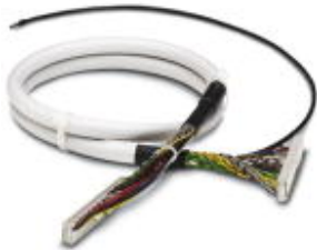
Round shielded cable set, with two 16-pos. socket strips (1:1 connection), length: 6 m

Please be informed that the data shown in this PDF Document is generated from our Online Catalog. Please find the complete data in the user's documentation. Our General Terms of Use for Downloads are valid ( http://phoenixcontact.com/download )