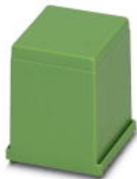
Covering hood, for the contact and dust-protected encapsulation of the components, in green design. Height: 52 mm, width: 50 mm

Please be informed that the data shown in this PDF Document is generated from our Online Catalog. Please find the complete data in the user's documentation. Our General Terms of Use for Downloads are valid ( http://phoenixcontact.com/download )