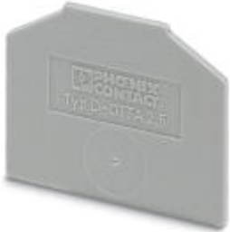
End cover, Length: 43.5 mm, Width: 1.5 mm, Color: gray

Please be informed that the data shown in this PDF Document is generated from our Online Catalog. Please find the complete data in the user's documentation. Our General Terms of Use for Downloads are valid ( http://phoenixcontact.com/download )