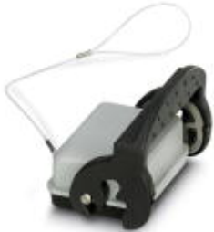
HEAVYCON protective cover, type B6, for sleeve housing without single locking latch, with retaining cord, IP54

Please be informed that the data shown in this PDF Document is generated from our Online Catalog. Please find the complete data in the user's documentation. Our General Terms of Use for Downloads are valid ( http://phoenixcontact.com/download )