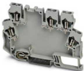
Housing fully equipped, with marker groove and additional PE contact, 5-pos., color: gray

Please be informed that the data shown in this PDF Document is generated from our Online Catalog. Please find the complete data in the user's documentation. Our General Terms of Use for Downloads are valid ( http://phoenixcontact.com/download )