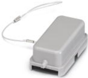
HEAVYCON protective cover, type D15, for supporting base element with single locking latch, with retaining cord, IP54, PA

Please be informed that the data shown in this PDF Document is generated from our Online Catalog. Please find the complete data in the user's documentation. Our General Terms of Use for Downloads are valid ( http://phoenixcontact.com/download )