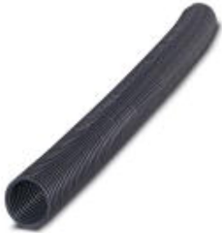
Protective hose, for protective house screw connection, packing volume: 50 m, Pg16

Please be informed that the data shown in this PDF Document is generated from our Online Catalog. Please find the complete data in the user's documentation. Our General Terms of Use for Downloads are valid ( http://phoenixcontact.com/download )