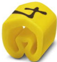
Conductor marking collar, Labeled with the number: Numbers, yellow, width: 3.2 mm

Please be informed that the data shown in this PDF Document is generated from our Online Catalog. Please find the complete data in the user's documentation. Our General Terms of Use for Downloads are valid ( http://phoenixcontact.com/download )