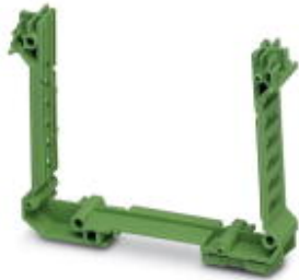
Component housing, Lower part, Color: green, Width: 17.5 mm, Number of positions cross connector: not relevant

Please be informed that the data shown in this PDF Document is generated from our Online Catalog. Please find the complete data in the user's documentation. Our General Terms of Use for Downloads are valid ( http://phoenixcontact.com/download )