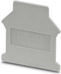
End cover, Length: 42.5 mm, Width: 1.5 mm, Height: 54 mm, Color: gray

Please be informed that the data shown in this PDF Document is generated from our Online Catalog. Please find the complete data in the user's documentation. Our General Terms of Use for Downloads are valid ( http://phoenixcontact.com/download )