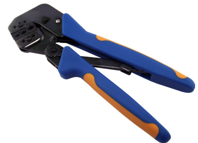
58433-3 - Pro-Crimper Commercial Hand Tool