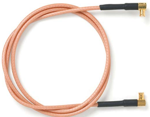
Model 73068 MCX Right-Angle Plug to MCX Right-Angle Plug, RG316/U

Snap-on coupling and miniature size for fast connect and disconnect where space is limited