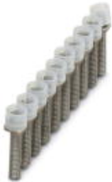
Jumper, Number of positions: 10, Color: silver

Please be informed that the data shown in this PDF Document is generated from our Online Catalog. Please find the complete data in the user's documentation. Our General Terms of Use for Downloads are valid ( http://phoenixcontact.com/download )